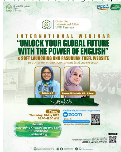
Image 1. Flyer for the webinar